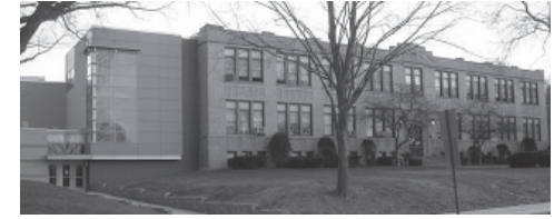
Highland School 31 Highland Avenue 201-445-3880