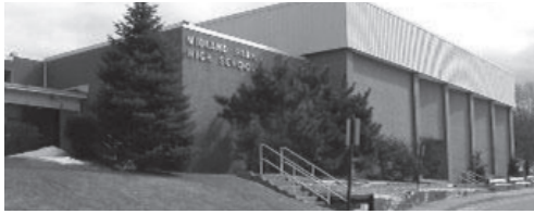
Midland Park Jr./Sr. High School 250 Prospect Street 201-444-7400